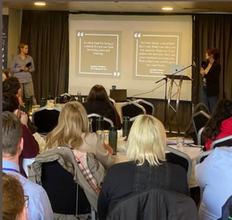
South Yorkshire Police, Raising the Voice of economic crime.