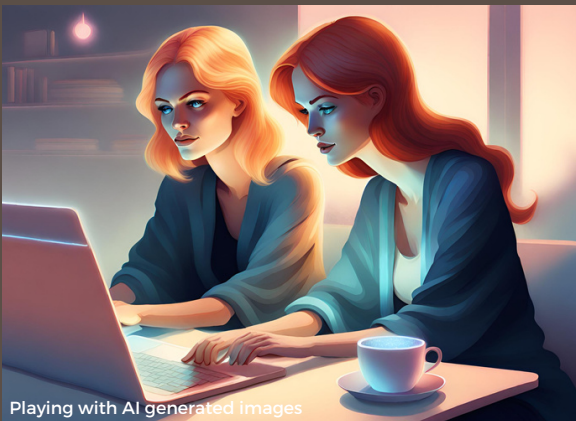
Playing with AI generated images